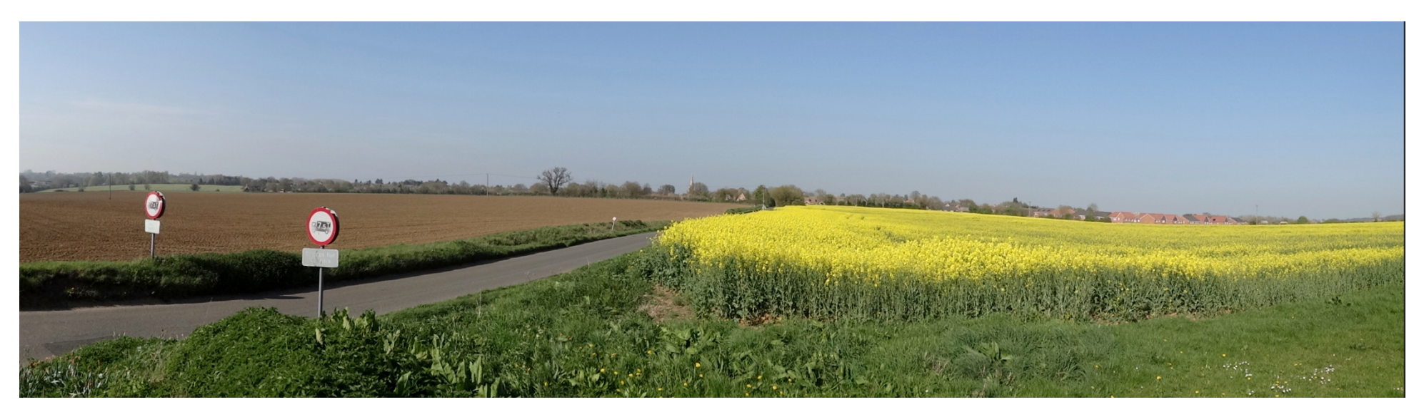
Key View C From Green Road, looking north towards the village