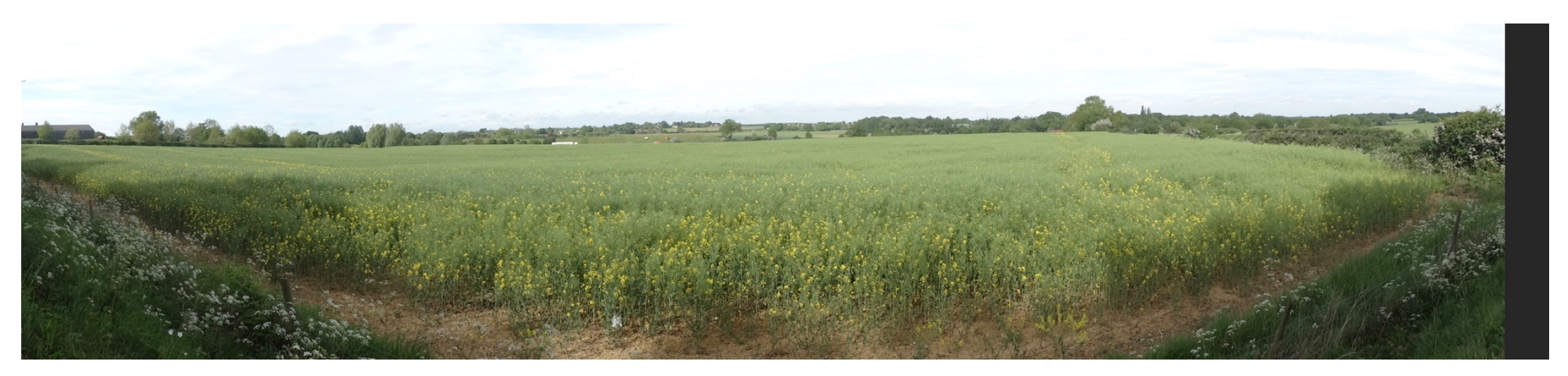
Key View K From Warren Lane, near Lawn farm, looking west towards Woolpit