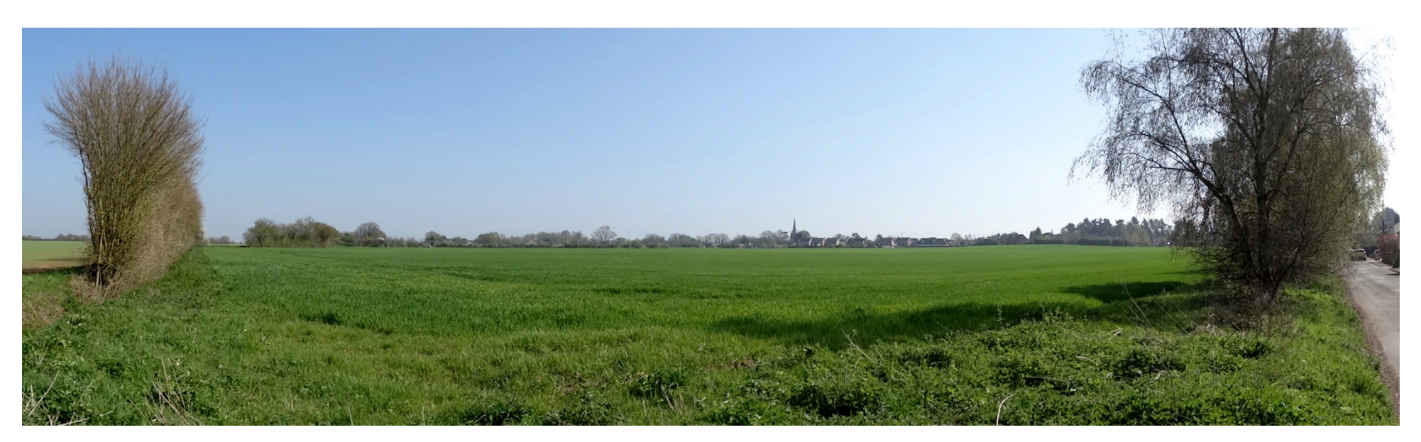
Key View B From White Elm Road, looking south-east towards the village