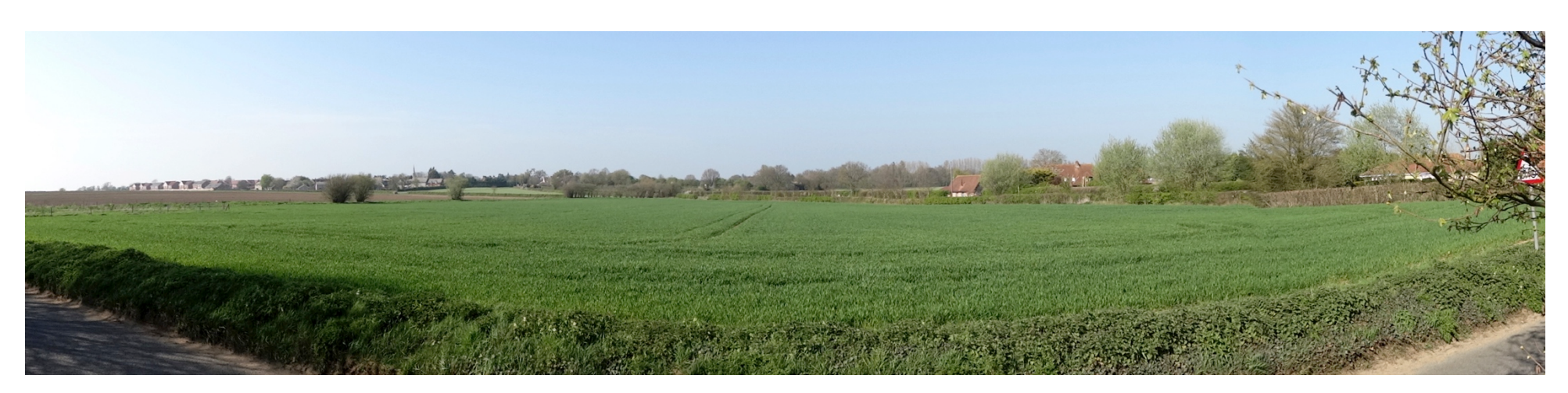
Key View E From Green Road, near Heath Road, looking north towards the village