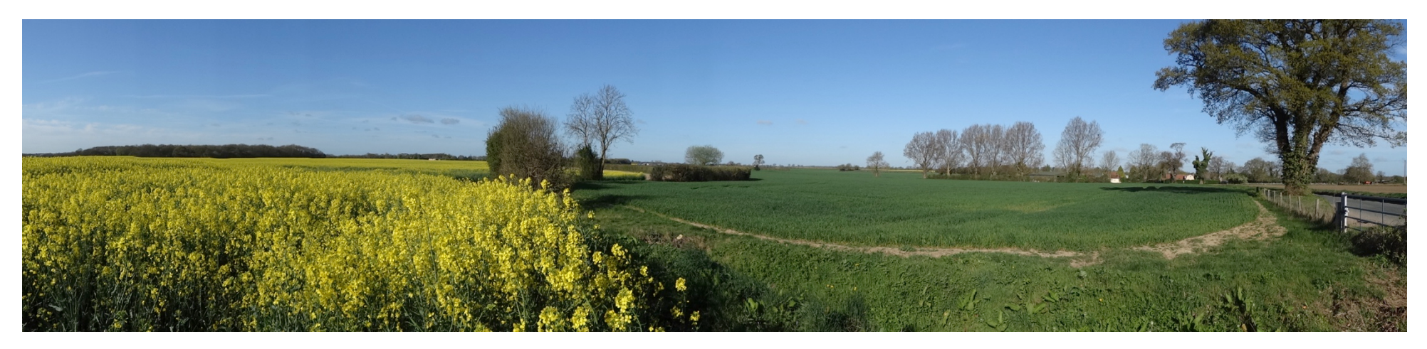
Key View L From The Heath, near Borley Green, looking south-west towards Clopton Green