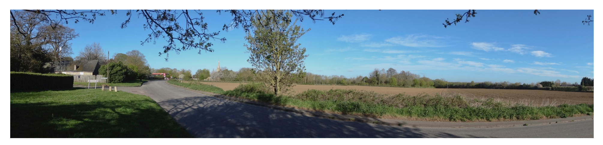
Key View F From Old Stowmarket Road, looking west towards the church