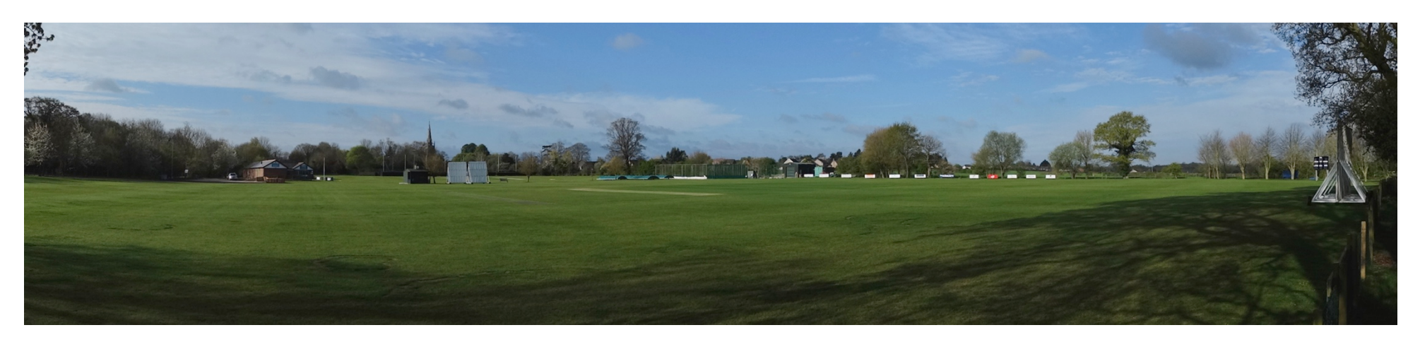
Key View D From the Elmswell road, looking south-west towards the church