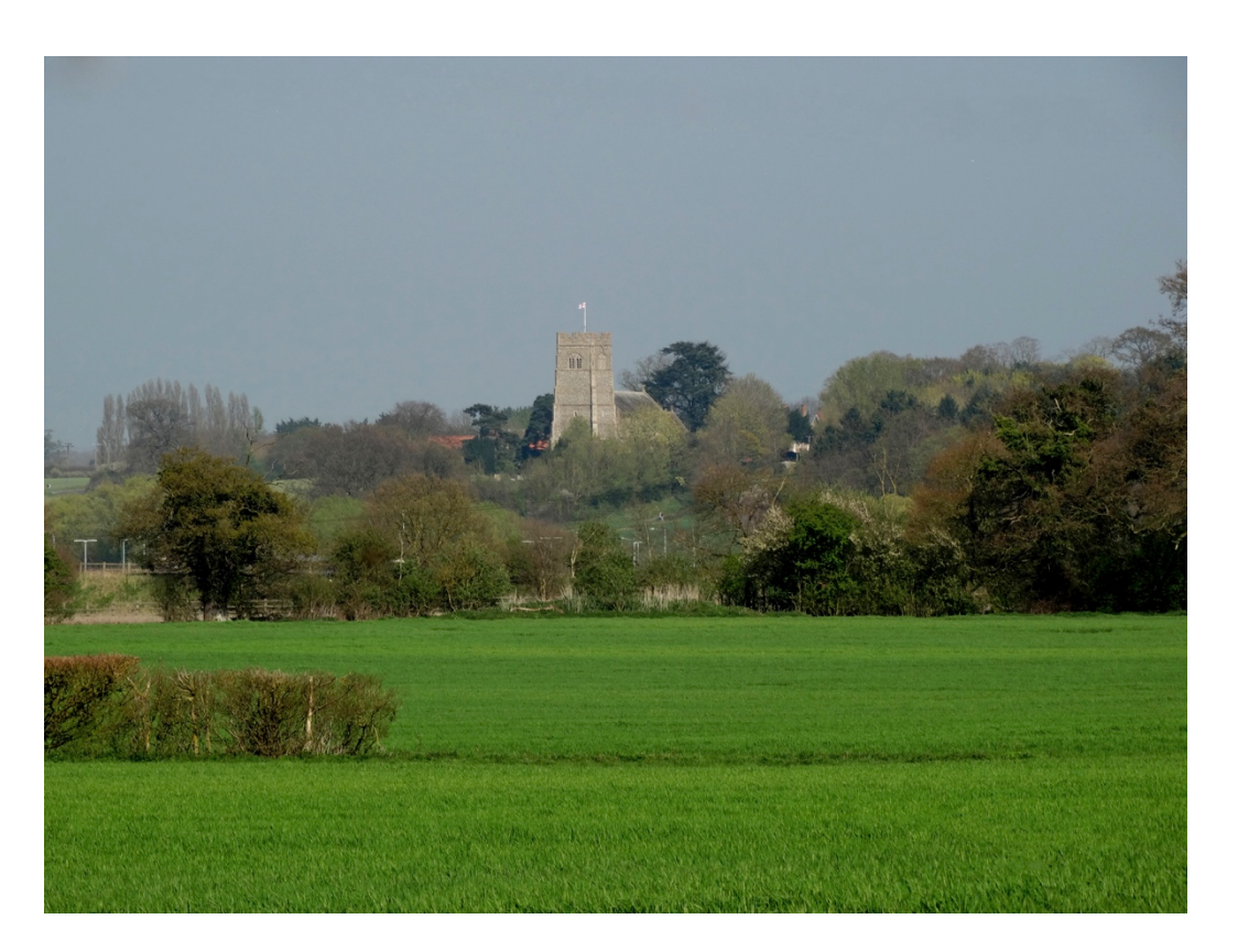
Key View G From Bury Road, looking towards Elmswell church