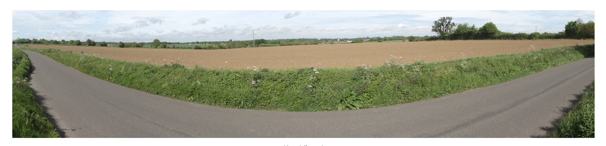
Key View I From Green Road, looking west towards Drinkstone Park