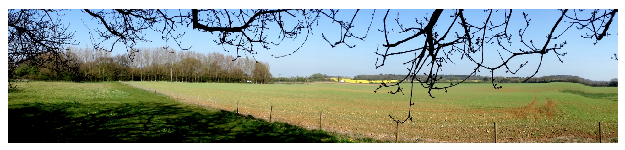
Key View J From the footpath near Heath Road, looking north-east towards Woolpit Wood