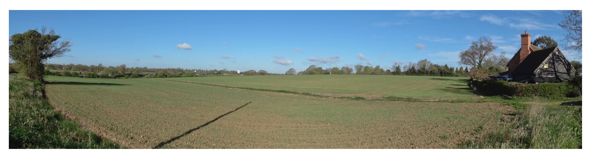
Key View H From Drinkstone Road, looking north-west over Bishop Karney Green